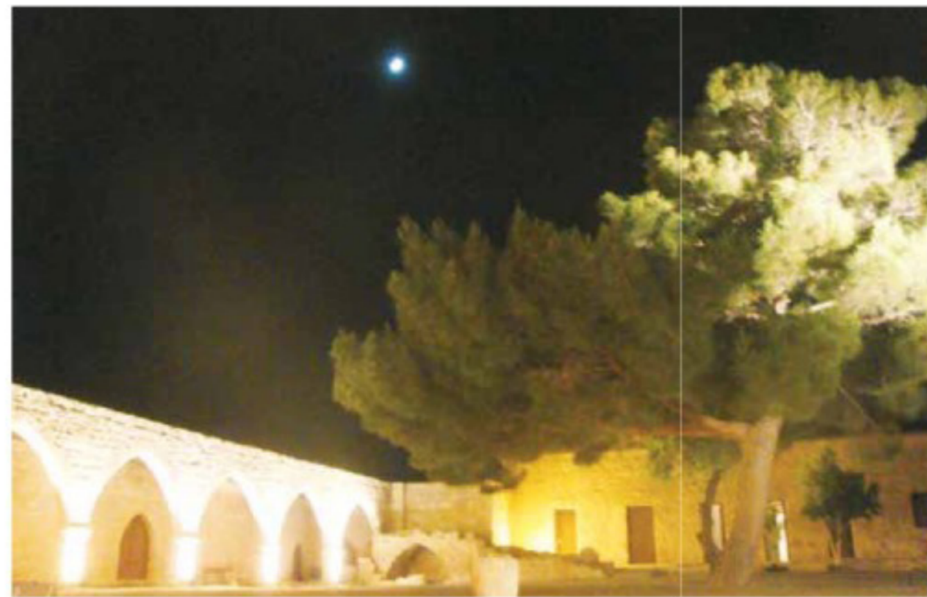
PART of the festival will take place at the Royal Manor House in Kouklia, Paphos

"Artistically, the Pharos Chamber Music Festival is going from strength to strength, year after year despite the numerous financial obstacles. Out of its 15-year history, the festival has taken shape and form and it has reached a huge base