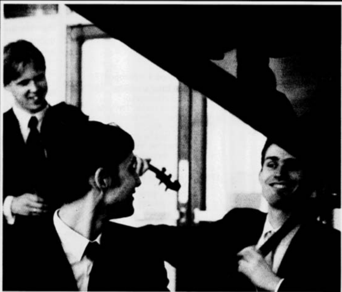
Trio Ondine, January 13, PASYDY Auditorium, Nicosia

Next concert not to be missed – Emma Kirkby and the London Baroque. February 3, Pasdy Auditorium, Nicosia. 8.30pm. 22-6635777 http://www.thepharostrust.org